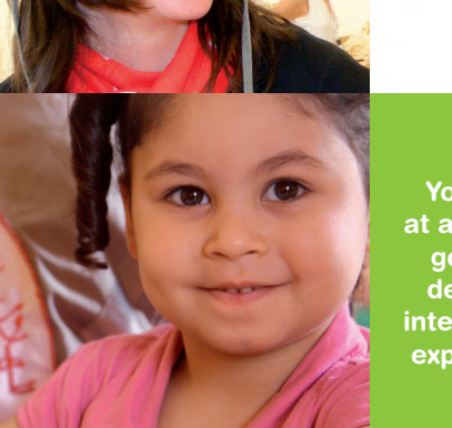
Youth in decision-making at all levels of management, governance, and service delivery as necessary for intergenerational transfer of experiences and continuity.