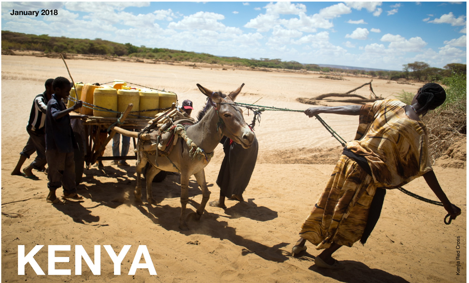
Kenya Red Cross